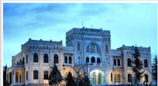
State Art and Sculpture Museum