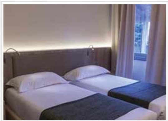
Hotel Room (Gazi Officers' Club)