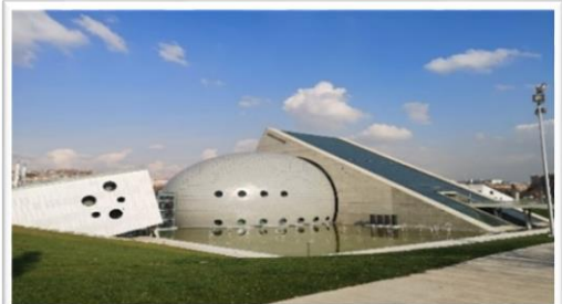
Presidential Symphony Orchestra Museum