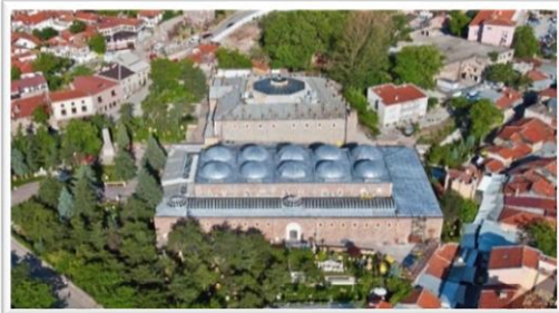
Anatolian Civilizations Museum