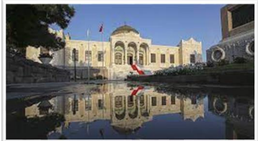
Ankara Ethnography Museum