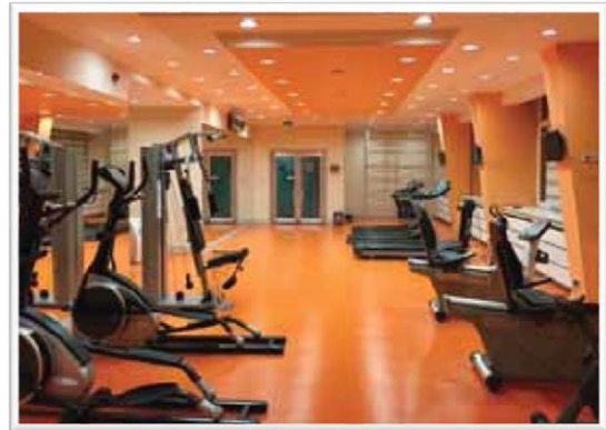
Gym (Gazi Officers' Club)