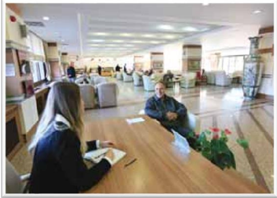
Lobby (Gazi Officers' Club)