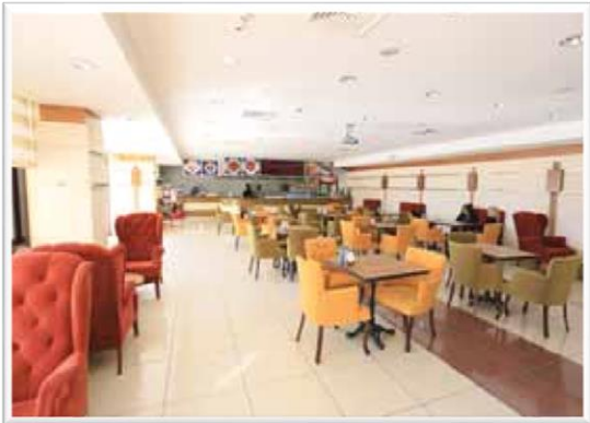
Fast Food Cafeteria (Gazi Officers' Club)